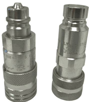
Pioneer Quick Coupler