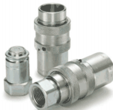
Pioneer 4250 Hydraulic Fittings