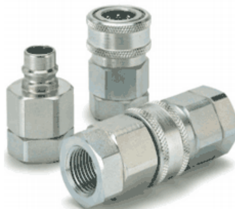
Pioneer Hydraulic Quick Disconnect