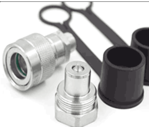
Pioneer Hydraulic Hose Fittings