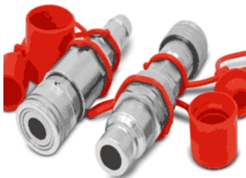
Pioneer Hydraulic Quick Connect Hose Coupling