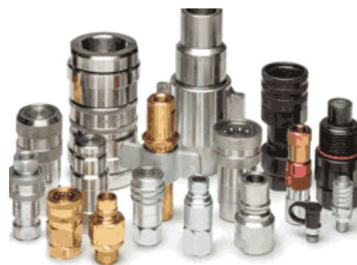
Parker Pioneer 3000 Hydraulic Fittings