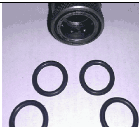
Pioneer Hydraulic Coupler O-Ring