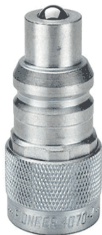
International To Pioneer Hydraulic Adapter