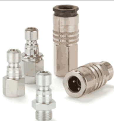
Pioneer Hydraulic Quick Coupler